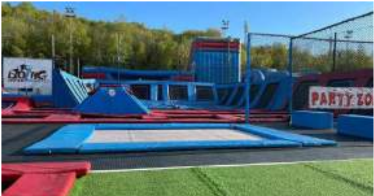
OUTDOOR IN-GROUND TRAMPOLINE