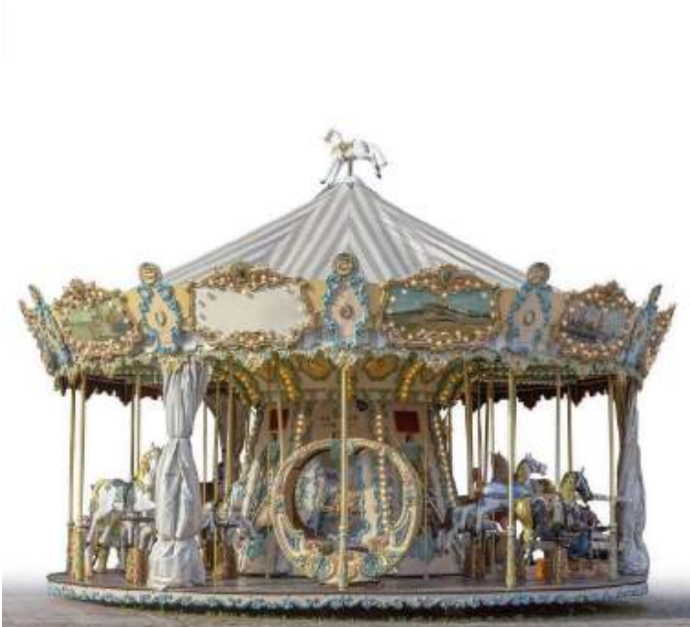
MERRY GO ROUND CAROUSEL