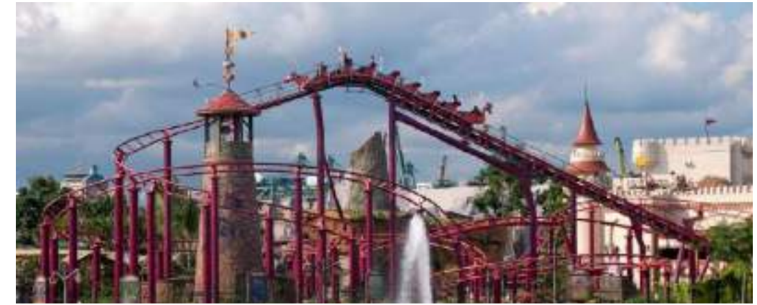
MID RANGE COASTERS