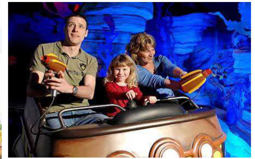
INTERACTIVE DARK RIDE

FAMILIES CAN HAVE FUN TOGETHER ON INTERACTIVE TRACKS, IN A MINE, CAVE OR HAUNTED CASTLE, ON BOATS OR ON A COASTER.