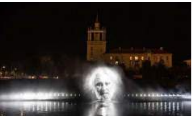
LASER AND LLIGHT SHOW

DIGITAL AND INTERACTIVE EXPERIENCES AND GAMES WILL BE AN INTEGRAL PART OF ALL PARTS OF THE ENTIRE COMPLEX: FROM THE ENTRANCE TUNNEL TO THE HISTORIC TOWN, THROUGH VARIOUS INTERACTIVE GAMES IN INDIVIDUAL PARTS OF THE PARK, INTERACTIVE PANELS, VIRTUAL REALITY AND GAMES IN THE INDOOR CENTER, 4D CINEMA, VIDEO PROJECTIONS ON INDIVIDUAL OBJECTS, LASER, WATER AND LIGHT SHOWS.