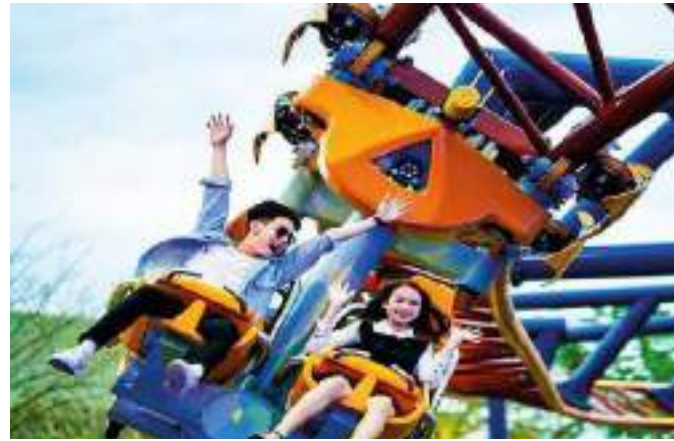
SUSPENDED SWING COASTER