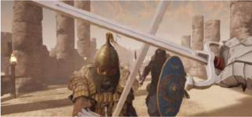
VIRTUAL REALITY GAMES