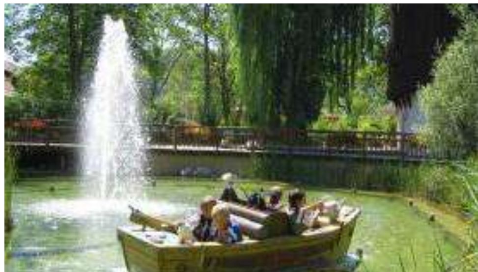
INTERACTIVE BOAT RIDE